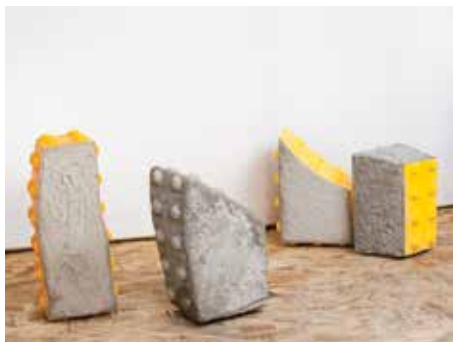
Courtney Sennish, Currents + FLUX exhibition.