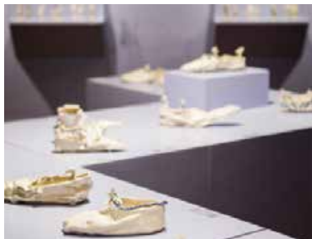
Installation view, Coille Hooven: Dancing for the Moon .