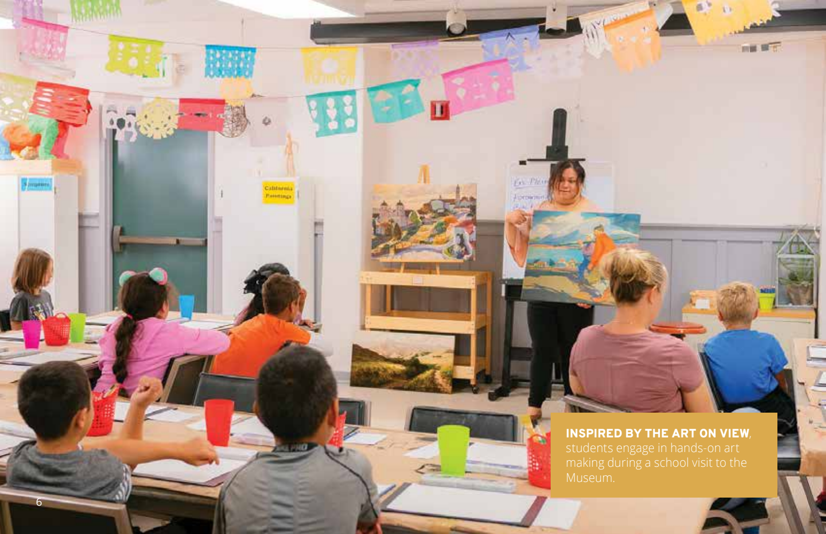
INSPIRED BY THE ART ON VIEW, students engage in hands-on art making during a school visit to the Museum.